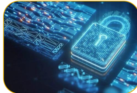
Technology & Security Enhancements