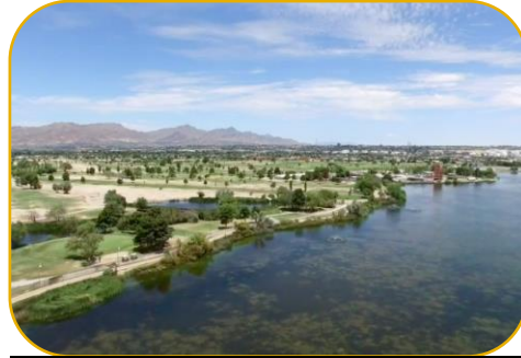
Regional & Local Parks