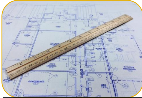
New County Facilities