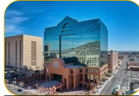
Modernizing Existing County Facilities