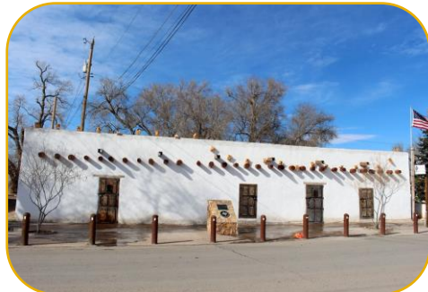
Historical Facility Renovation & Preservation