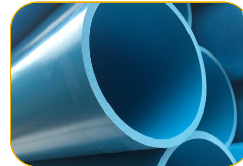
Water Utility Improvements