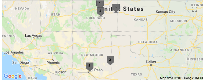
Dark Gray pins Represent Home Dealer for Your Area