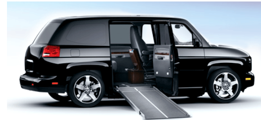
Category 8: Specialty Vans