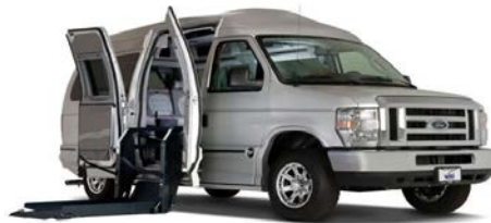
Category 7: Mo Vansbility