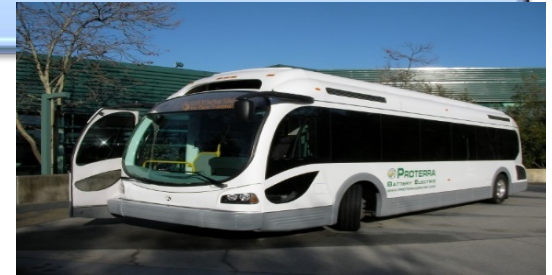
Category 3: Electric