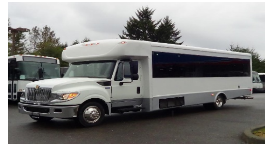
Category 6: Medium Duty Transit Vehicles/Cut-Away