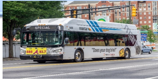
Category 2: Transit