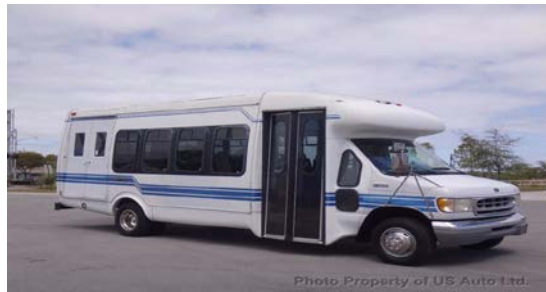
Category 5: Light Duty Transit Vehicles/Cutaways