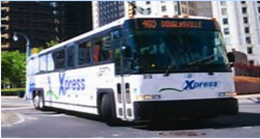
Category 1: Coach