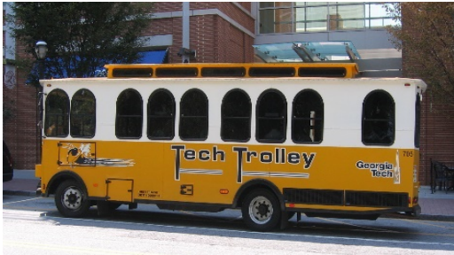
Category 4: Trolley